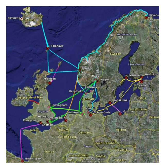
Figure 1. Map of the North West European shelf sea area showing the routes of Ferry-box systems in operation in March 2009.

The Ferry-box concept has developed as a partnership between scientists and the companies operating ferries in waters around the world. The potential for data coverage by ferries is large. Eight hundred (800) operate in European seas. In Europe, some 30 ships are involved in this type of work (<u>www.ferrybox.org</u>) and systems have also been in operation for some time in Japan (Harashima & Kunugi, 2000) in the USA (Ensign & Pearl, 2006; Paerl et al., 2005) and Australia. A co-ordinated data collection operation is that run by the International Sea Keepers Society (<u>www.seakeepers.org</u>). A map of the routes currently carrying Ferry-boxes on the North West European shelf is shown in Fig 1. Progress has been considerable since it was reviewed by Miller et al., (2002).